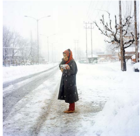
From the project Snow , exhibited in Homelands: Art from Bangladesh, India and Pakistan at Kettle's Yard, Cambridge © Sohrab Hura.

Written by British Journal of Photography Published on 1 November 2019