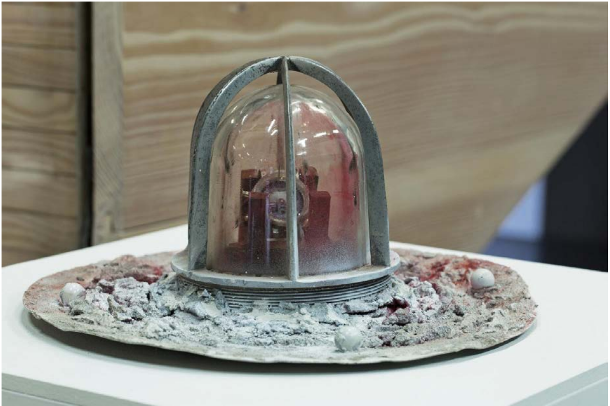
Ronni Ahmed Time Machine, 2016.