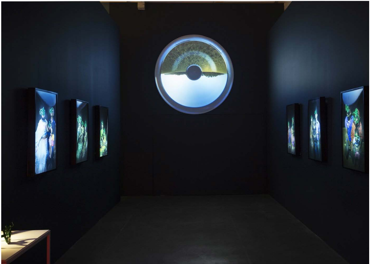
Firoz Mahmud's "Soaked Dream" light boxes + Zihan Karim's Eye from 2014 appearing as an all seeing divine being in one of t museum architecture's cul-de-sac ".