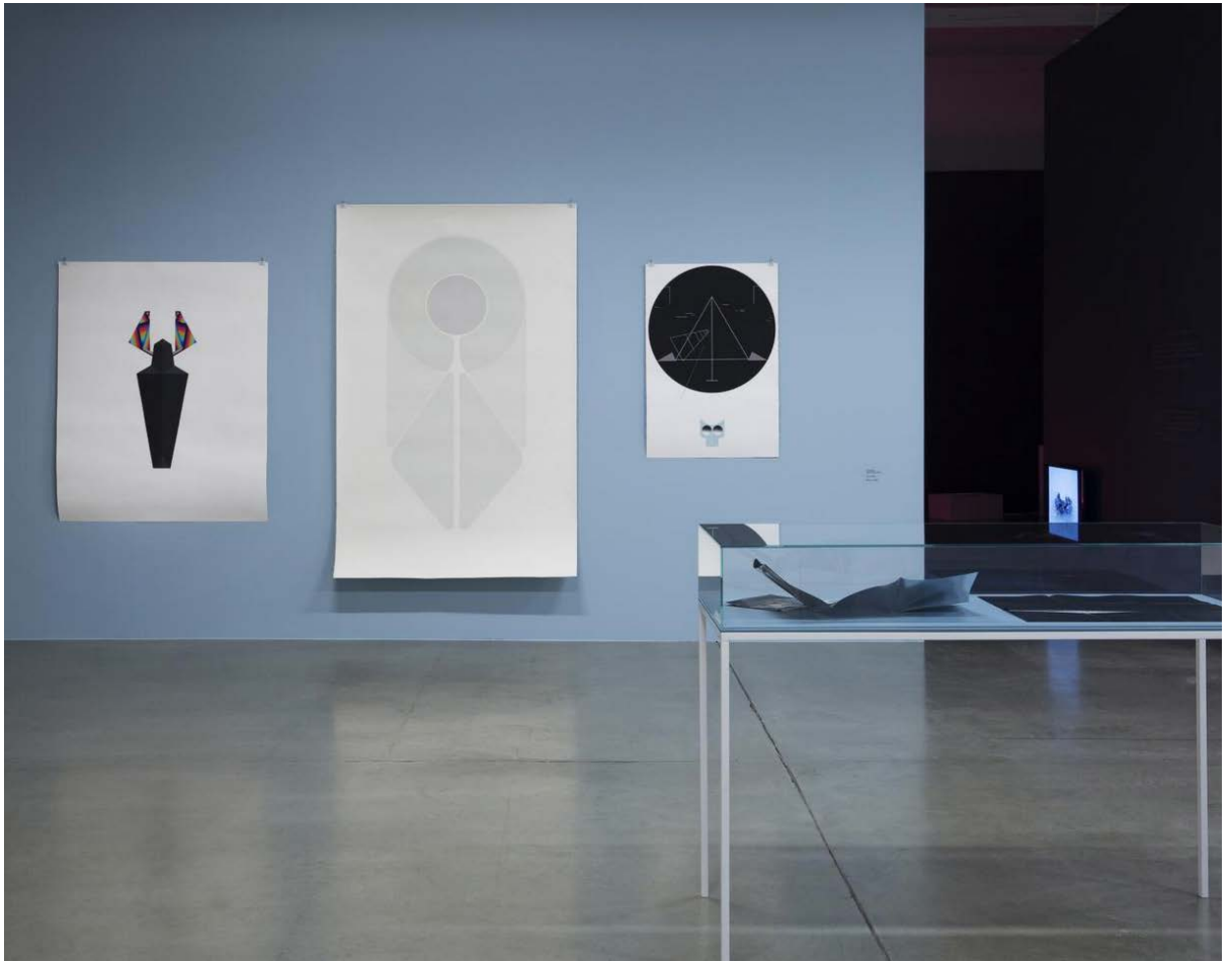
View of the exhibition showing the prints by Fahd Burki.