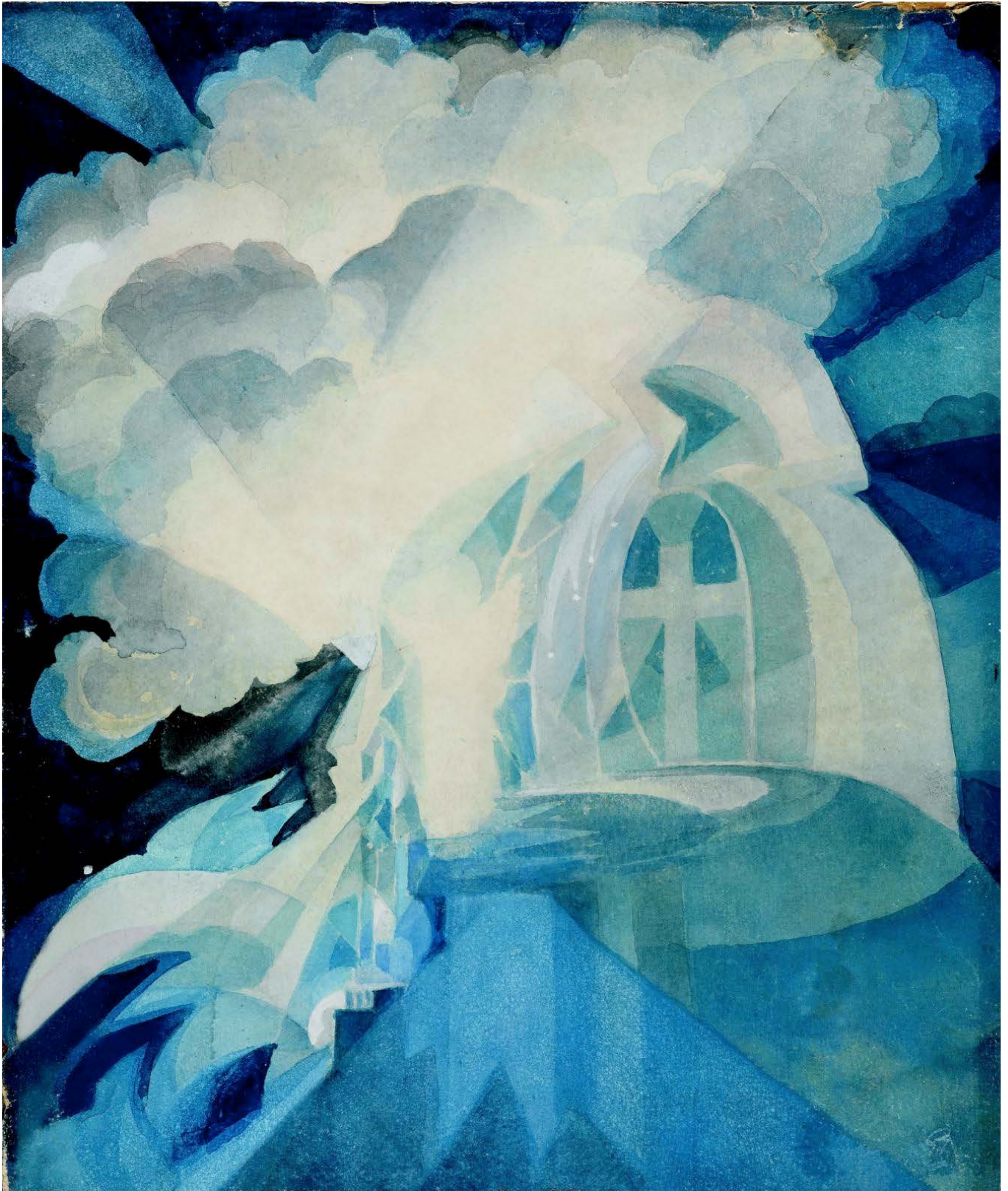
The vantage point for The Missing One Gaganendranath Tagore's Resurrection , 1922.

In the new exhibition at OCA, language and technology common to the field of science fiction creates the backdrop to an exploration of human nature and how we